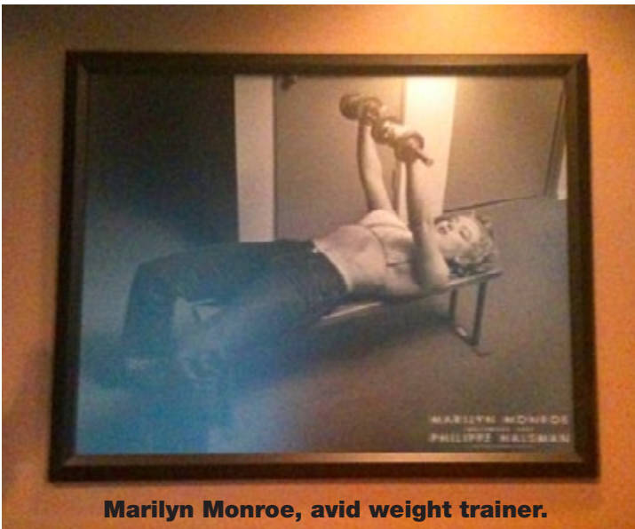
Marilyn Monroe, avid weight trainer.

When you've been at this working out thing as long as we have, you begin to think you know it all—and that's when you can get into trouble. You should never stop learning. That lesson hit us over the head hard a few years ago when we finally discovered key "secrets" to getting in ultimate shape quickly—but we're getting ahead of ourselves.