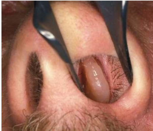
Figure 2. How a nasal polyp looks like.